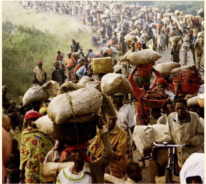
Tutsi villagers on the run from Hutu militiamen in Rwanda, summer 1994. The United Nations made a decision not to classify this as genocide, as that would have required them to commit peacekeepers to the area. Instead, a small group of Dutch soldiers did their best to keep the peace, but failed.

What are the common elements that lead to the types of ethnic or tribal insurrections that eventually allow people to murder others based on those differences?