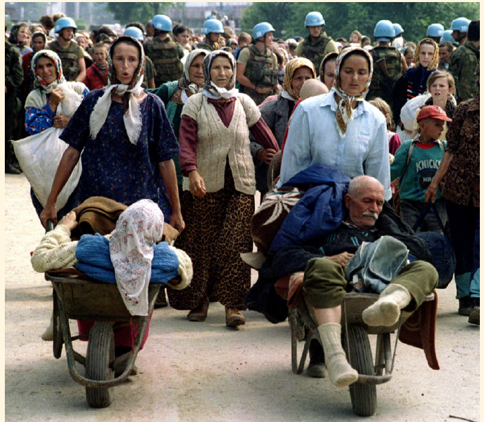
Bosniaks flee Srebrenica in summer 1995, ahead of the Bosnian Serb forces who eventually murdered almost every man and boy in the village. The Bosnian segments of ANNE FRANK: thinking myself out take place just before and after this episode.

It was a short route from that message to ethnic cleansing, since the goal of a "Muslim-free Bosnia" could be easily measured by the Serbs, with each village destroyed.