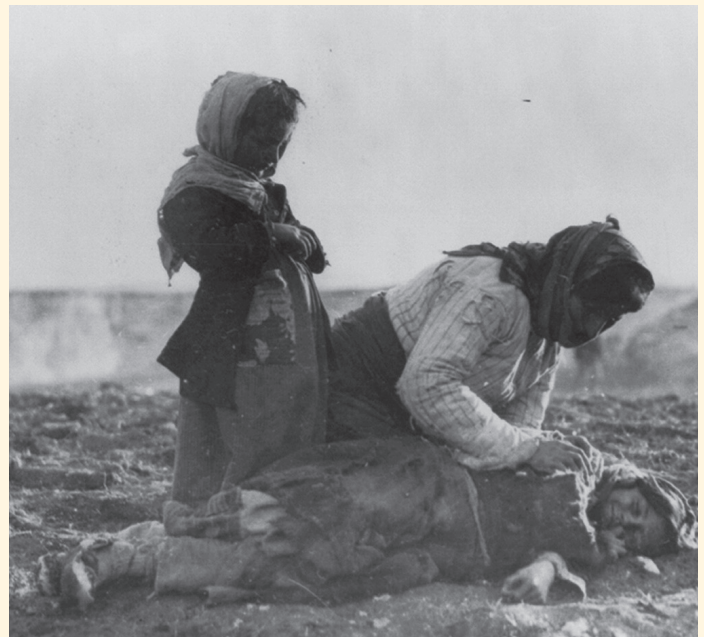
Armenian mother holds vigil over her dead daughter during the exodus to Syria (1915). To this day, the United States does not acknowledge that this event constituted genocide, because the Turkish government would object to that characterization.

In Anne Frank: thinking myself out , the two Armenian characters are seen at the very beginning of Turkish invasion and their story illustrates both the history of what happened and shows them grabbing for a common coping technique for the victims of oppression: story-telling.