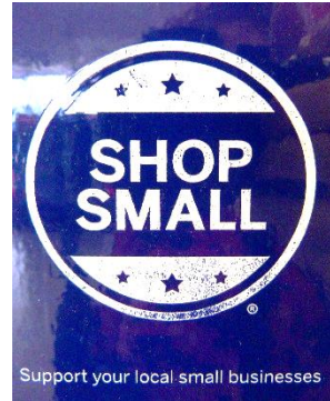
Small Business Saturday supports businesses in the local community.

Business Saturday”). This event looks to ride the wave of post-Thanksgiving consumer spending, but unlike Black Friday the emphasis is on spending money that will directly benefit businesses in the local community. 1 In addition to Small Business Saturday, the slogan “Shop Local” has morphed into various versions: Drink Local. Eat Local. Read Local. Make Local. Participation by more and more local businesses and local patrons suggests that there is indeed a desire for autonomy in communities and that embracing the idea of “local” can begin to shape unique boundaries for the community. Another part of the “local” movement ripe for support is the community space that serves as a haven for serious discourse, challenging ideas, and artistic expression.