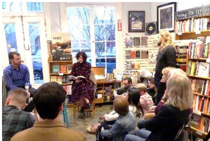
Author readings offer public spaces for community voices.

Local, independent bookstores strive to offer events and build relationships that emphasize authenticity and foster community. One example is the frequent hosting of author readings. While many of the readings feature national writers, a strong number of them are readings by local authors. By hosting readings with local writers, the independent bookstore offers a public space for community voices and a chance for a