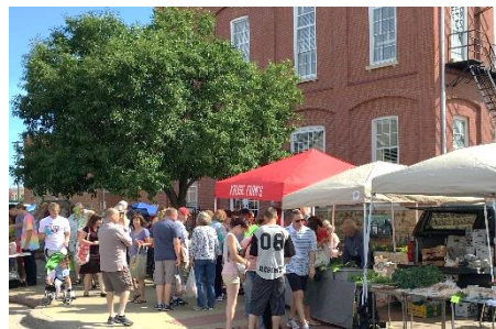
Farmers markets reflect local values and character.

Supporting locally-sourced food can help us avoid self-deception about how our consumer choices affect the region. Rather than blindly purchasing highly packaged, processed, and distributed food, people buying from a local farmer are able to learn about and begin to understand the farming process, lessen the impact of packing and shipping, and also see firsthand the hard work and integrity that a small farmer puts into producing food. They can see immediate models of how choices affect outcomes in the regional community. For many