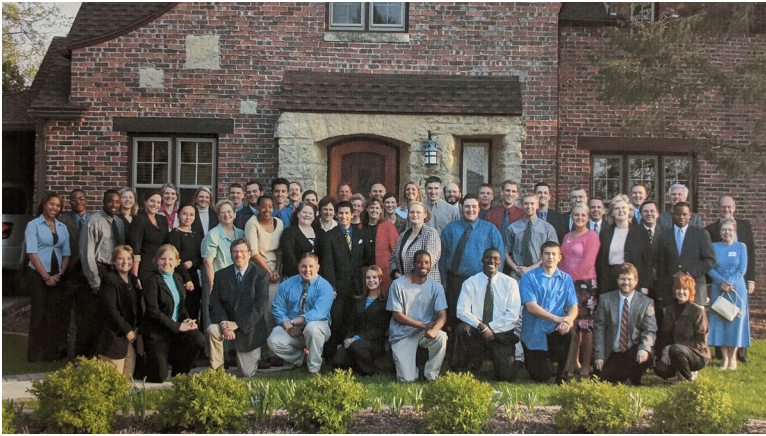
Inaugural class of Wendt Character Scholars, 2004-05 The Character Scholars program began with a commitment to holistically engage students through self-reflection, academic exploration of character, and service.

The Wendt Character Initiative established programs to cultivate a culture of good moral character on UD's campus. With the exception of the Dubuque Opportunity Scholars Program, the main pillars of the Initiative put into place in 2004 continue to be maintained today: